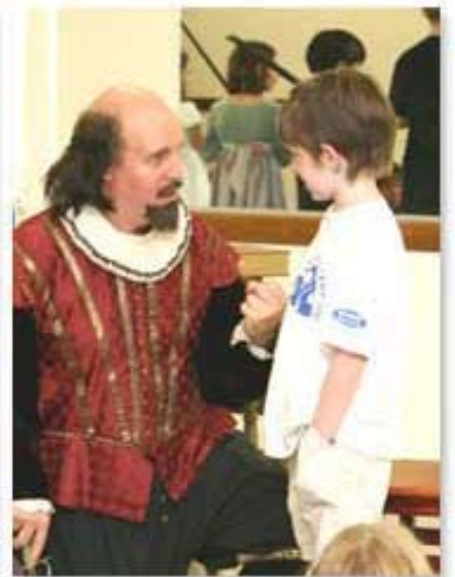
Shakespeare pays a visit to a local school.